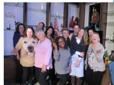
The Board Clowning Around